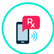
Accept Verbal Orders for Prescriptions

*Please refer to CPhA's latest " COVID-19 and CDSA chart " for an overview of authorized activities by jurisdiction.