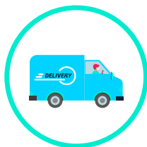
Direct Pharmacy Staff to Deliver Prescriptions