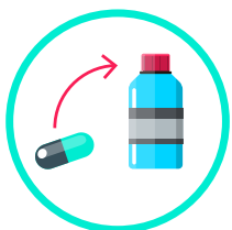
Adapt Prescriptions (adjust dose, regimen or formulation; taper or stop)